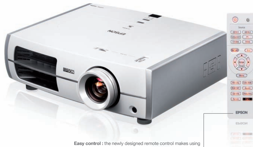
Easy control: the newly designed remote control makes using the EH-TW3800 even easier. Sit back, relax, and take advantage of all the power and functions of this projector.